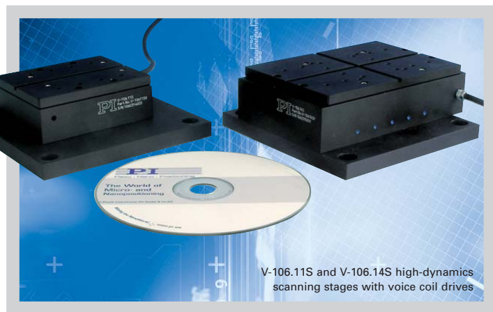
V-106.11S and V-106.14S high-dynamics scanning stages with voice coil drives