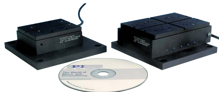
V-106.11S and V-106.14S high-dynamics scanning stages with voice coil drives