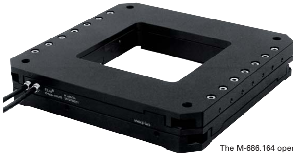
The M-686.164 open-frame stage (version with shifted cable exit) with closed-loop piezo motors provides 25 x 25 mm travel range