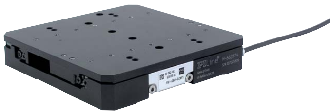
M-682 Translation stage