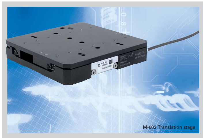
M-682 Translation stage