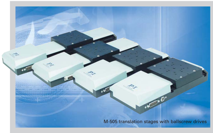
M-505 translation stages with ballscrew drives