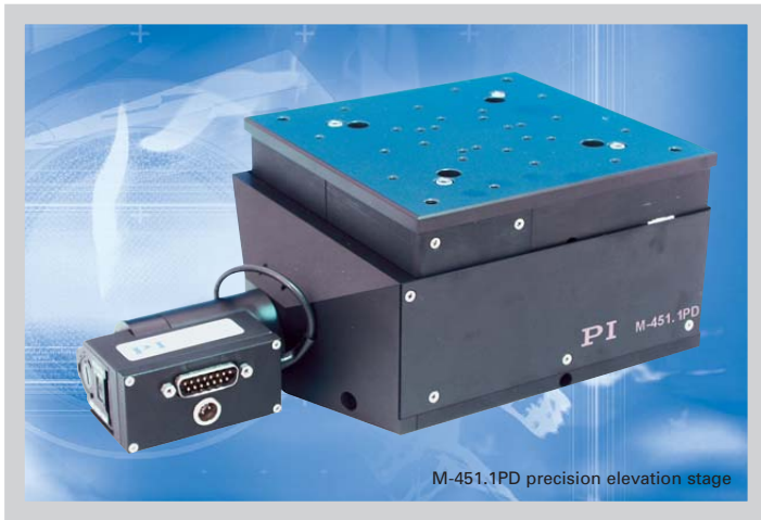
M-451.1PD precision elevation stage