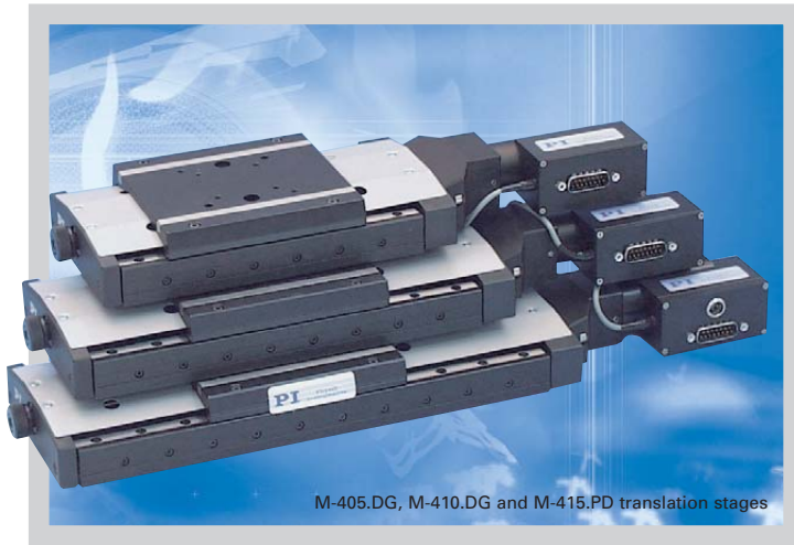
M-405.DG, M-410.DG and M-415.PD translation stages