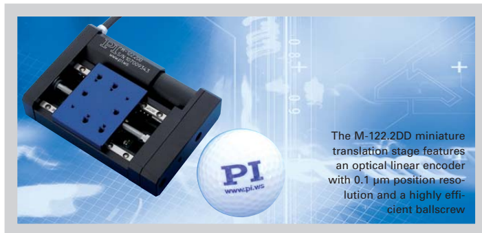
The M-122.2DD miniature translation stage features an optical linear encoder with 0.1 µm position resolution and a highly efficient ballscrew